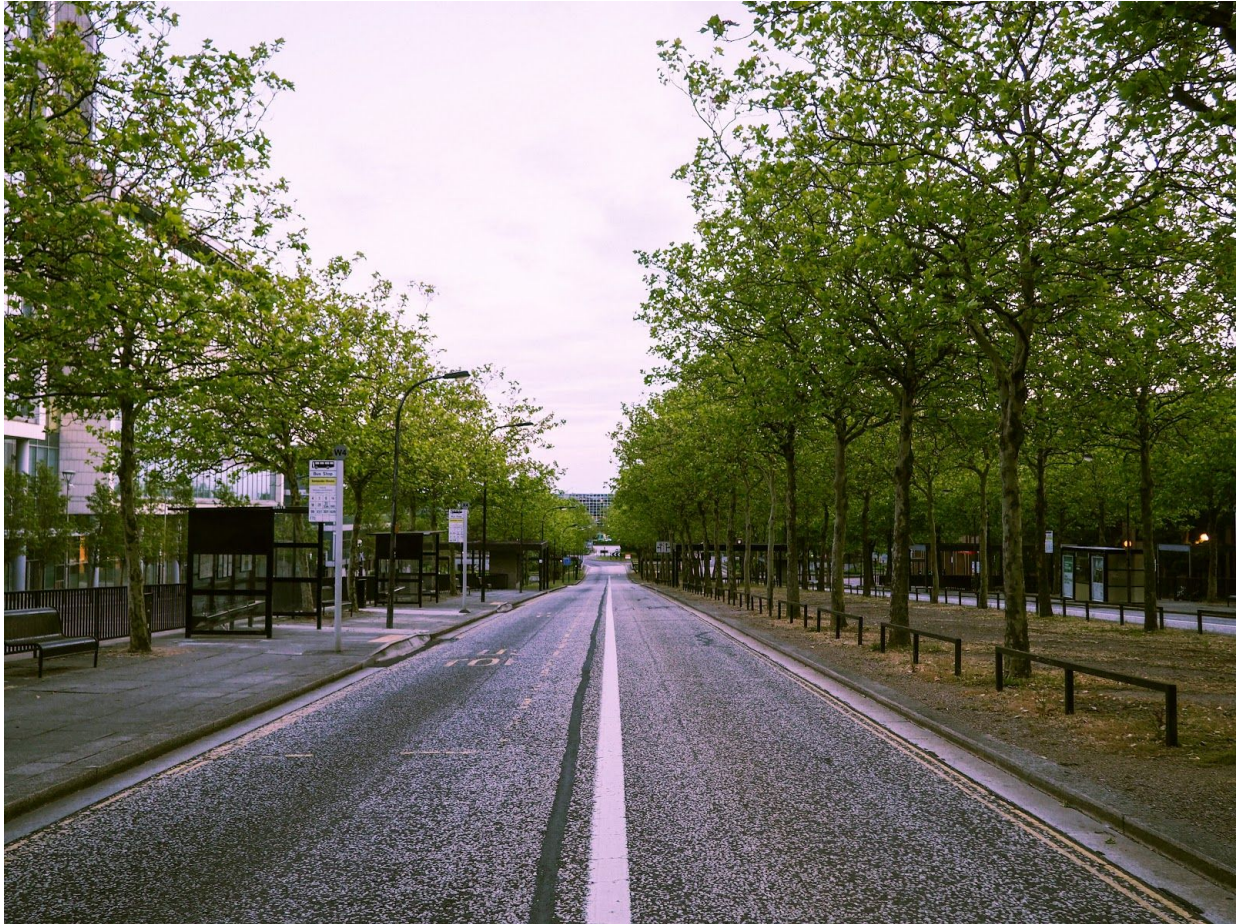
An empty Midsummer Boulevard – June 2020