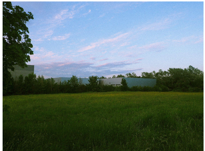
Left Undeveloped - May 2020

This trip also uncovered to me what looked like a mistake in the planning of the road/path network in the area - potentially indicating an incohesive approach in the planning of this estate.