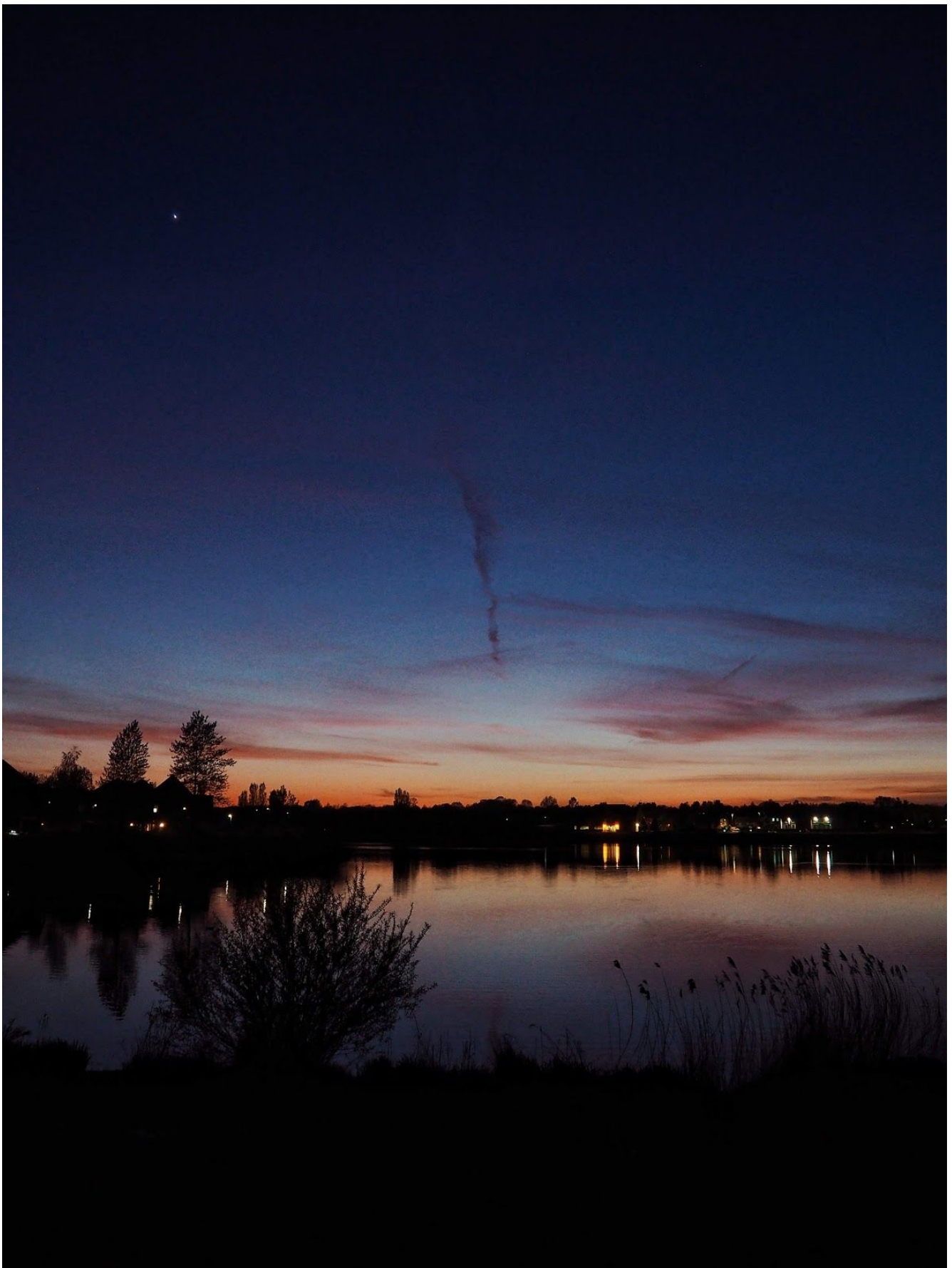
A sunset by the Lake - April 2020

Sunsets - they often evoke memories, a beautiful sunset brings you back to one of the other times you experienced something like it. These things don't change , regardless of if there's a global pandemic raging through society.