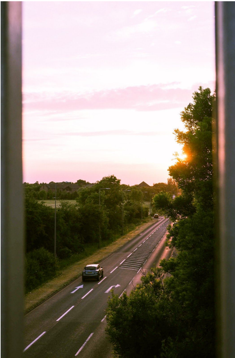
A selection of scenes in Central Milton Keynes - June 2020

I've been interested in the liveability of Central Milton Keynes in the past, and the lockdown has cleared out the streets totally leaving just lifeless, eerie streets and office blocks.