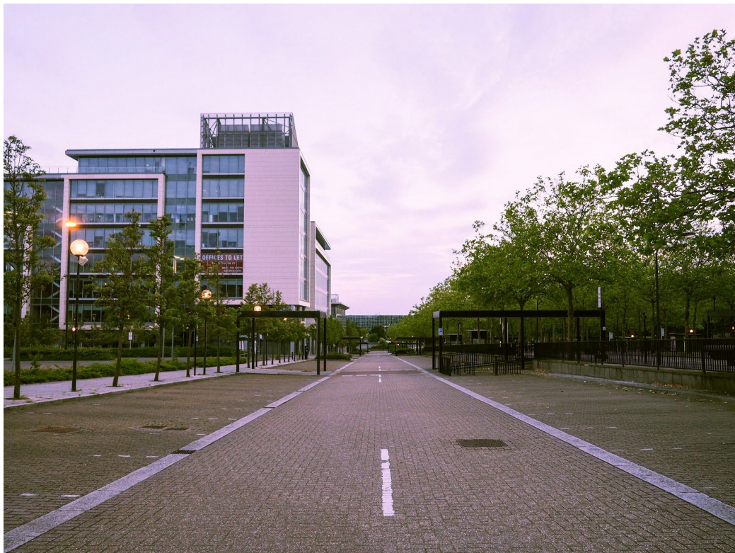
No one's at work – June 2020