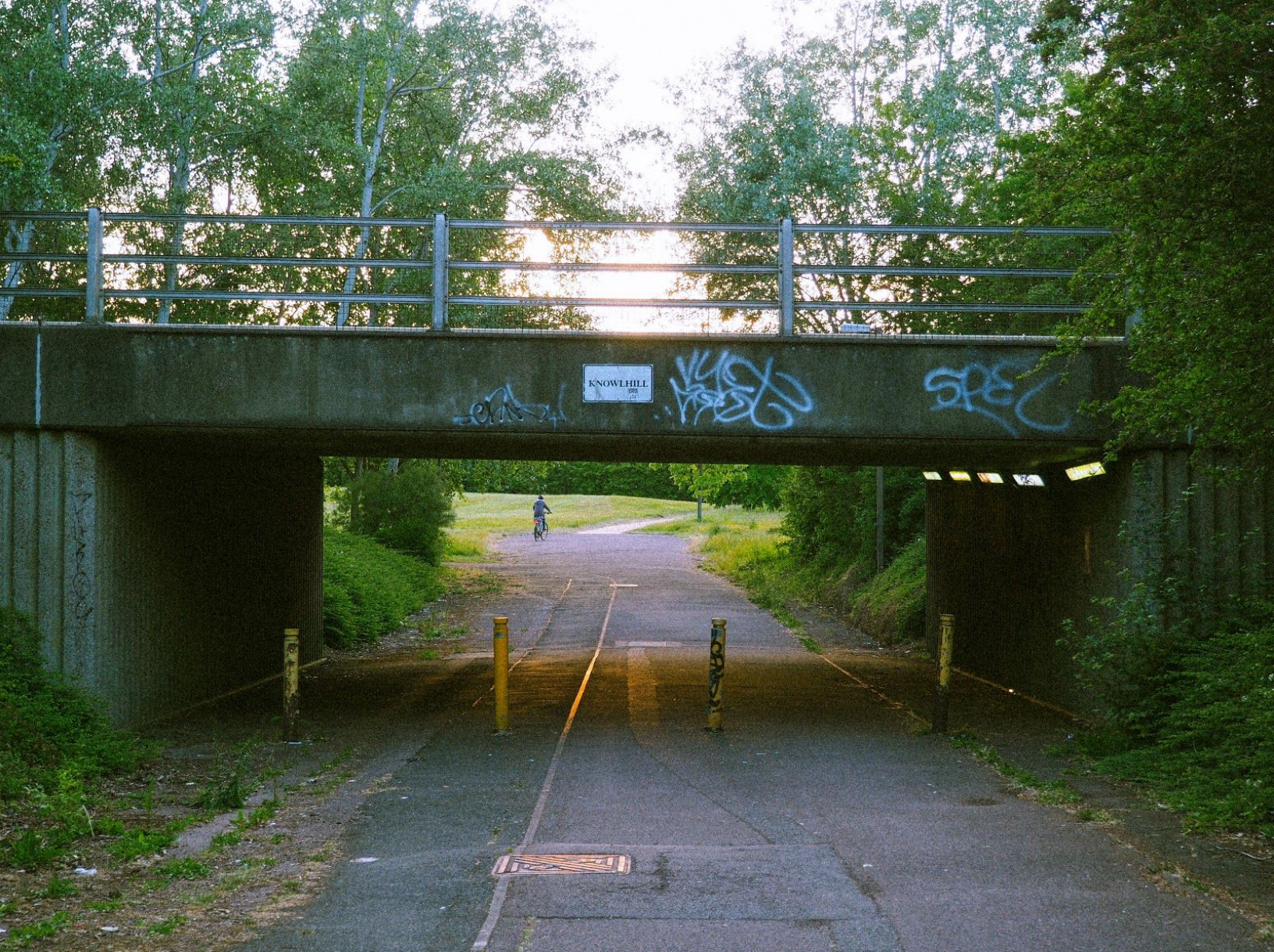
A Connected Disconnect - May 2020